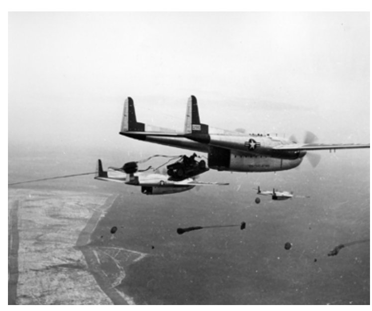
C-119s disgorging cargo in a paradrop.